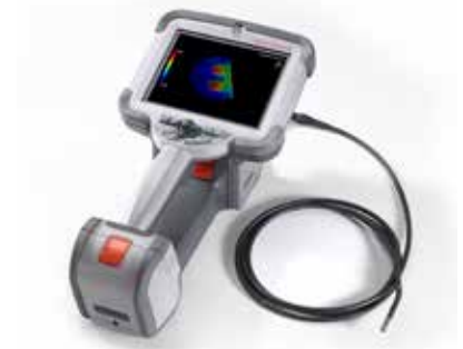
Mentor Visual iQ Analyze Our most capable VideoProbe with 3D Phase Measurement, extreme image quality and greater Probability of Detection