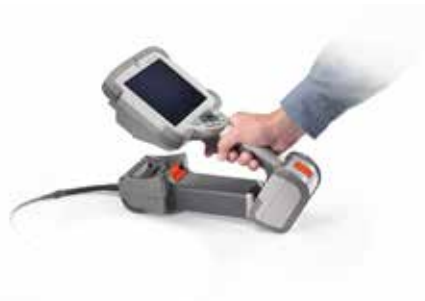
Mentor Visual iQ Touch Improve productivity with quick change probes and touch screen