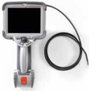
Mentor Visual iQ Inspect Best in class image quality and connectivity at a value price

Mentor Visual iQ VideoProbe is available in three customized platform configurations to meet inspection needs across industries and applications.